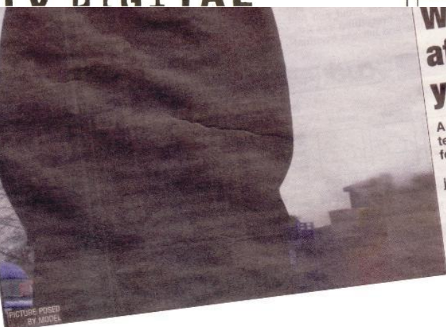
PICTURE POSED BY MODEL